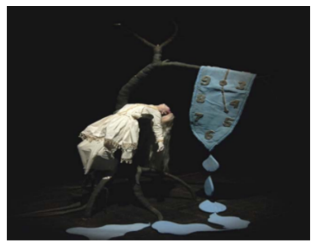
Figure 12: Lady Macbeth gloating on the Phak letter (Thiyam, R. 2017)

The adaptation of the Western play by Manipuri directors itself is a product of hybridization, the ways in which they adopt or appropriate the Western text into indigenous performance are creatively polished not only in the storytelling of the plot but also in the interweaving of Western static art into moving artwork. Western art such as The Persistence of Memory by Salvador Dali (Fig 13) and The Flying Fish by Marc Chagall (Fig 15) are incorporated into the visual story of Ashibagee Eshei. This highlights Thiyam's prowess in making visual art correlate with the dramatic text. Dali's painting The Persistence of Memory is captured on the stage as the Melted clock representing Irene's memory stuck in the moment of her past decapitating her emotional time (Nilu, K. 2010) (Fig 12). The way Thiyam connected Dali with Ibsen is brilliantly done on a stage evoking a surrealist statement without dreaming but awe-inspiring. Nobody would have thought of Irene's chagrin with a surrealist statement but the re-representation of Dali's The Persistence of Memory brings a nuanced understanding of Irene's character in Thiyam's adaptation.