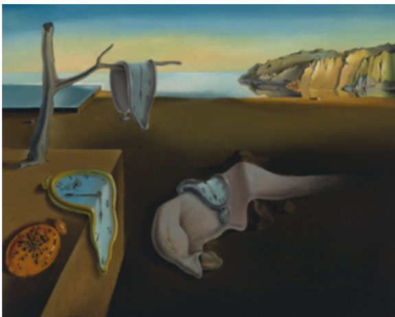
Figure 13: Lady Macbeth gloating on the Phak letter (Thiyam, R. 2017)

The moment of Irene's emotional death translates into her stillness while the clock hangs loose depicting Irene's stuck in the past. The difference between Dali and Thiyam is the number of objects they used in their artistic creation. Although Thiyam uses three objects (The leave-less tree, Irene, and one jointed melted clock) as compared to Dali's numerous details, Thiyam is apt in communicating his art in concrete detail.