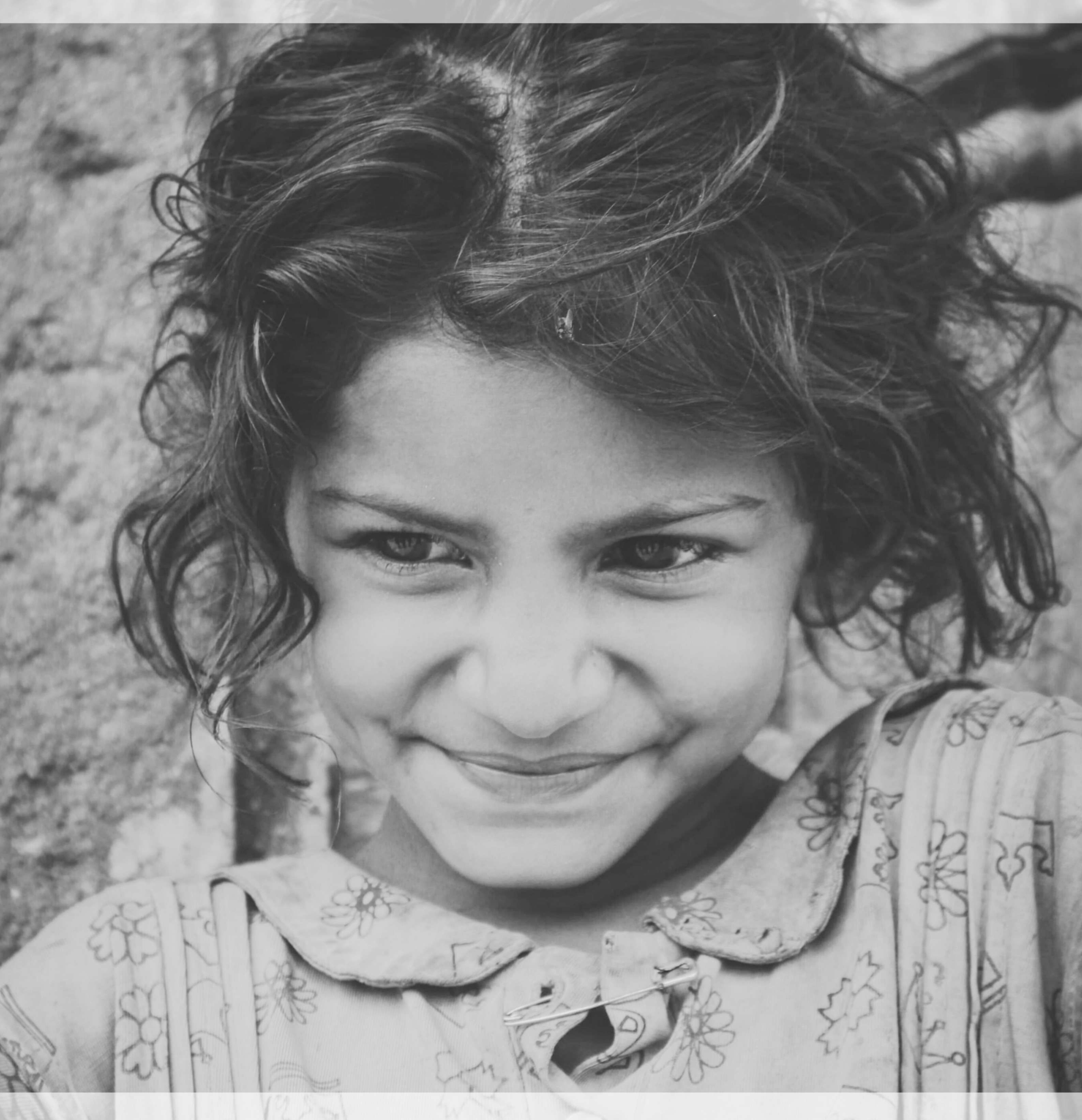
Colors of Womanhood: Vibrant Lives Across India