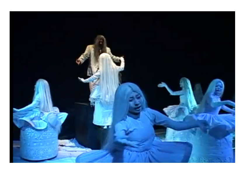
Figure 4: Rubek and Irene united in spiritual realm (Thiyam, R. (2010b)

Taking Ibsen's adaptation of When We Dead Awaken- Ahshibagee Eshei Thiyam's use of visual drama is the main method of communication for the national audience since they cannot understand Manipuri. The adoption of visuals is extremely effective in withholding audiences' attention but the non-verbal cues complemented with screaming dialogues reaching out to the audience gives prominence to the performance. In the adapted play Macbeth, Thiyam uses the tribal motifs primarily to construct a modern oriental tribal land, the music and the sound communicate the aggression leading to greed and ultimately Macbeth's destruction.