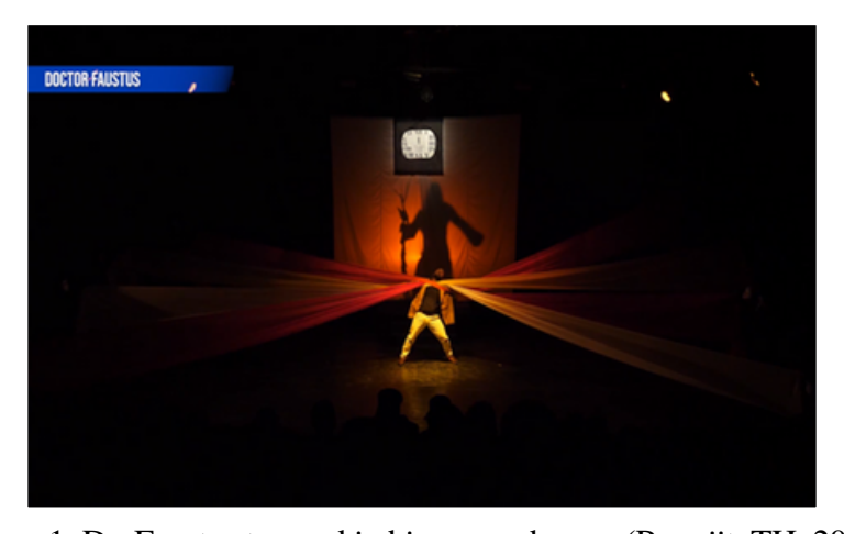
Figure 1: Dr. Faustus trapped in his own schemes (Premjit, TH. 2021)