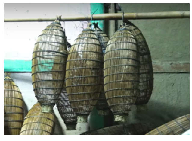
Figure 7: Army in Macbeth wearing Kabo-Lu as a headgear (up)(Thiyam, R. (2014) & Kabo-Lu the fishing trap (down)(MAIBAM, R. 2021)