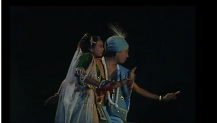
Figure 3: Arjuna explains Chakravyuha to Subhadra. (Cinema Vision India, Mumbai (CVI). 2018)

The cultural performance displayed on Gandhari's costume set apart Manipuri's Hindu identity while at the same time, its stark elemental difference from the Sari a common Hindu marker makes Manipuri's adaptation of Andha Yug exotic. While aesthetic representation displays cultural grounding, actors playing characters are exotified as well. The factor of otherness is defined not only by aesthetics but also by the actors involved in plays. Mahabharata in conventional cinemas and Hindi serials, is portrayed by actors of North Indian descent, thereby normalizing rigid representation of Indian Epics. Thus, when Arjun and Draupadi are on stage in Chakravyuha (Fig 3) the entire scene played by Manipuri actors could give an out-of-the-ordinary experience for the national audience.