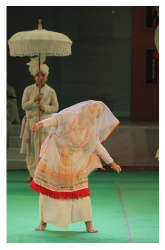
Figure 6: A Maibi in trance (Kongkham, R. 2023)

The tribal costumes worn on the land of Macbeth are even created by Thiyam's vision of a tribal that does not exist in real life(Sarkar, S. 2018, August 13). The point of how he creates a fictionalized tribal people is questioned further on his choices of objects that he tries to present as a tribal aesthetic. The use of a fishing trap (Kabo-Lu)<sup>11</sup> as headgear for the tribal men is rather exotic to the eye than accurate(Fig 7). Macbeth's hairstyle or for that matter Lady Macbeth's hairstyle does not have any close resemblance to any tribe of Manipur. Could it be just a mere construction of a tribal people or are local audiences able to find some resemblance in the play? Thiyam has purposefully used Manipuri elements although they are tweaked heavily to suit his creative vision, they however stir up debate regarding the question of the intended audience.