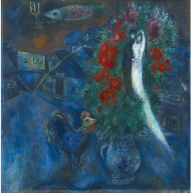
Figure 15: The Flying Fish, 1948 (Chagall, M. n.d.)